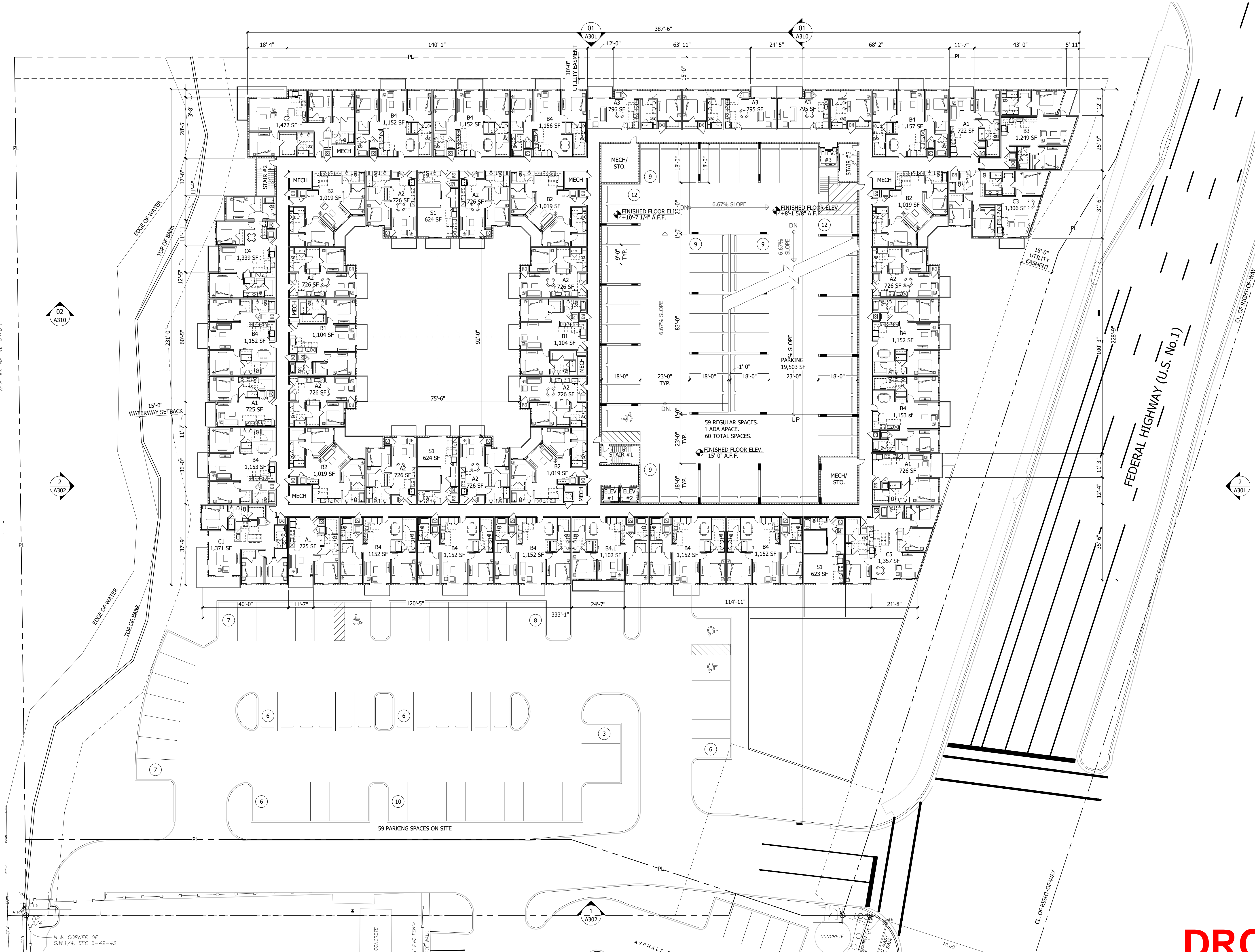
1 2ND FLOOR SCALE: 1"=20'-0"